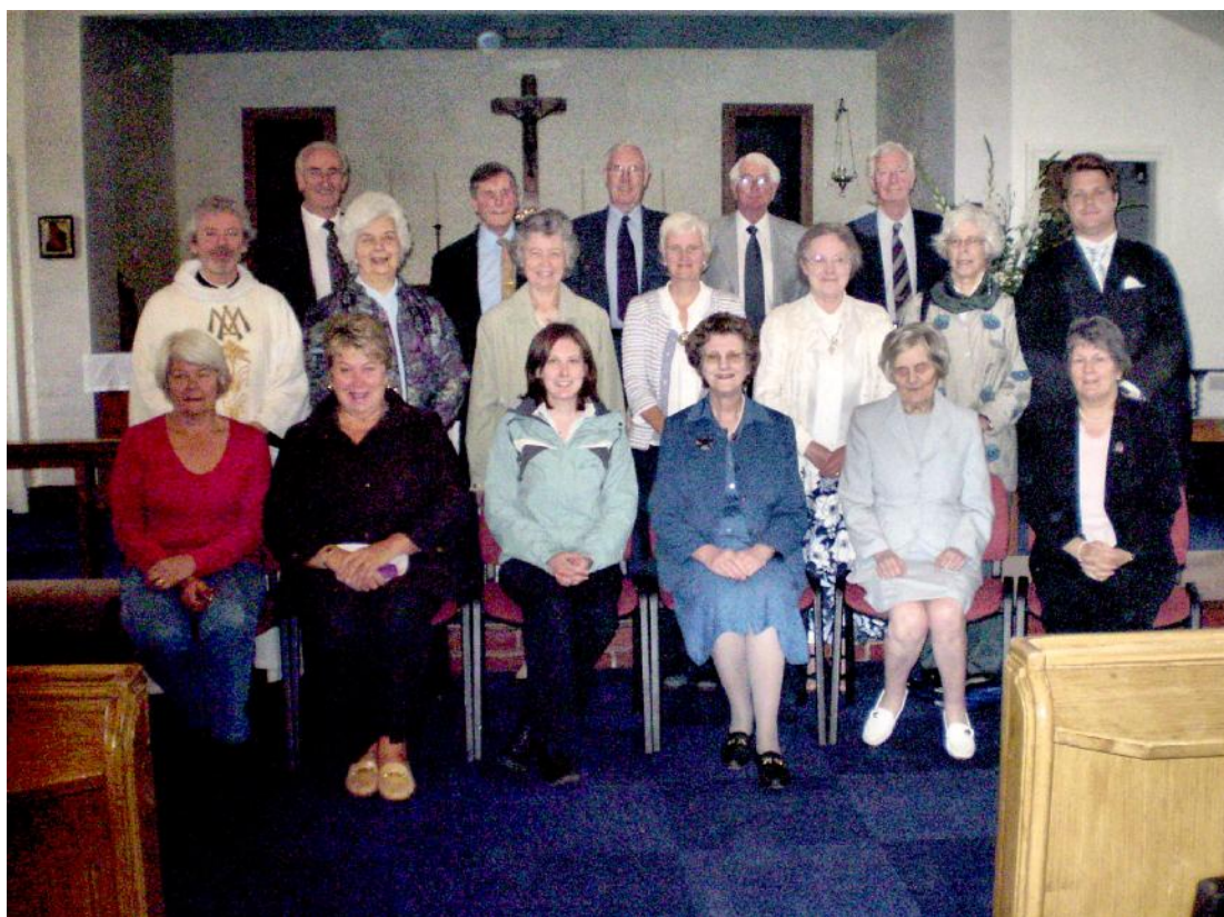
The Choir augmented by members of the choir of Morningside Parish Church, Cluny Gardens 23 August 2007 – Festival Mass for the Dormition of the Blessed Virgin Mary