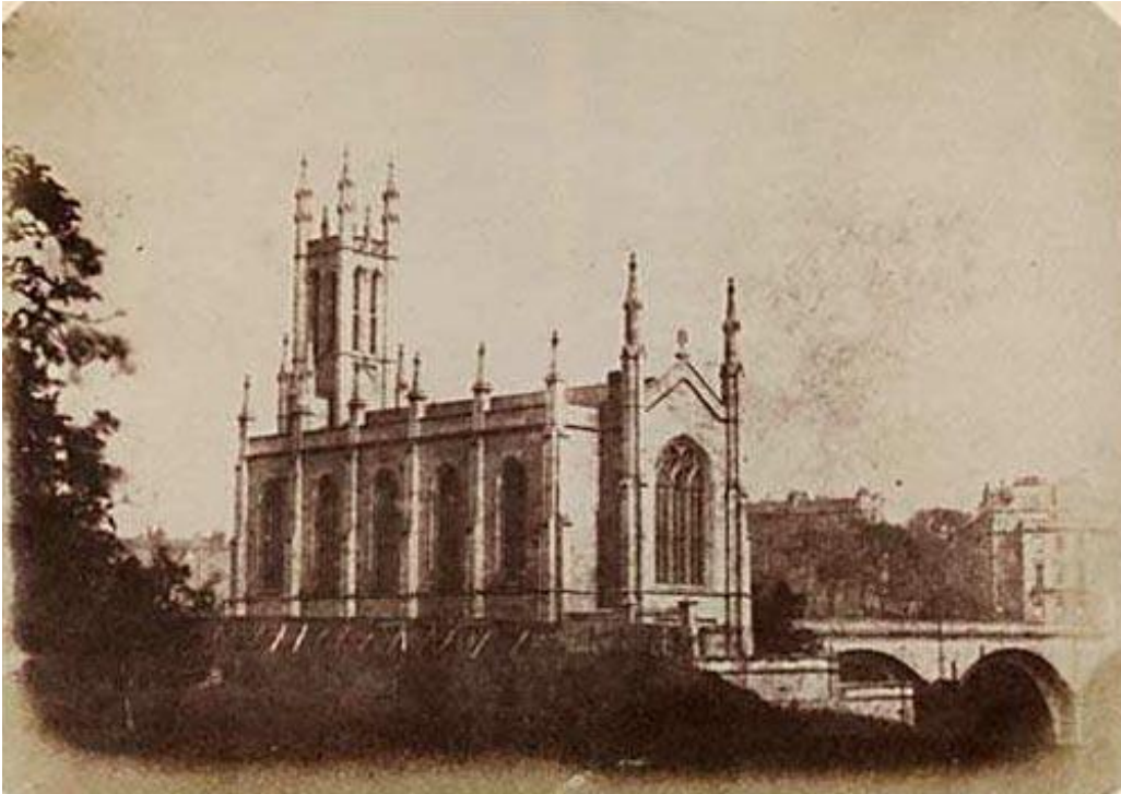
Holy Trinity, Dean Bridge, Edinburgh

St Ninian's Episcopal Church had its origins in a mission church established in St Bernard's Row, Stockbridge by Holy Trinity Church, Dean Bridge in the mid-nineteenth century. The small church occupied premises on the first floor above Trinity Episcopal School which opened in 1864.