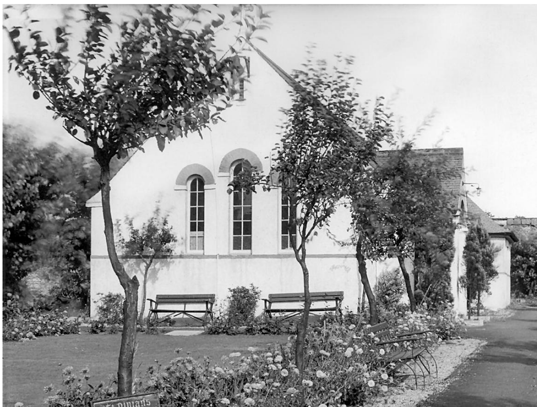
St Ninian's Picture Archive